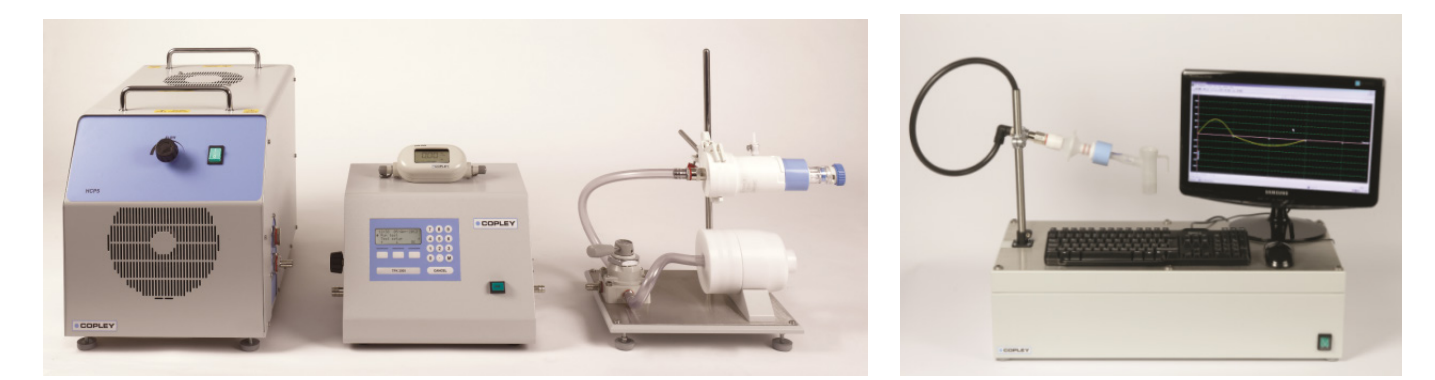
Figure 7: DUSA set-ups vary for different OIPs. A standard set-up for DPIs (left) and nebulisers (right) is shown here.

Compendial methods for the measurement of particle size specify the technique of cascade impaction. Unlike other particle sizing techniques, cascade impaction generates a particle size distribution for the drug substance, rather than the formulation as a whole, and, has the added advantage of measuring aerodynamic particle size, a parameter of intuitive relevance in the specification of OIPs. The Pharmacopoeias recommend several commercially available impactors for testing MDIs and DPIs, but the three most widely used