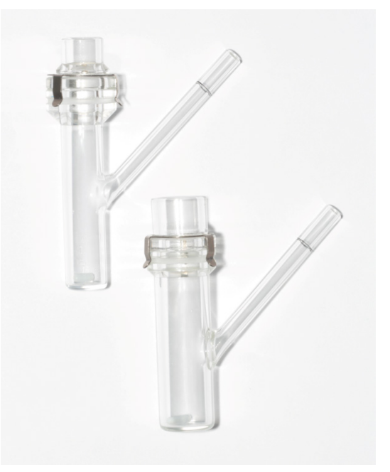
Figure 4: 7 and 20 ml VDC designs are available for testing different volumes of semisolids.

Performance tests for semisolids are now detailed in (proposed) USP Chapter <1724> which describes three different apparatuses for the determination of drug release: Vertical Diffusion Cell (VDC); Immersion Cell; and Flow Through Cell (Apparatus 4). Of these the VDC is emerging as the preferred option, due to its simplicity and reproducibility.