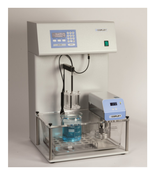
Figure 2: A simple apparatus for standardised, reproducible disintegration testing

During disintegration testing the tablet or capsule is held in a tube within a basket assembly which moves up and down in a vessel containing a defined volume of simulated gastric fluid, held at 37°C (see figure). A plastic disc inserted in the tube, along with the sample, assists disintegration. The lower end of the tube is covered by a sieve mesh and the tablet is deemed to have passed the test if no residue remains on this mesh after a certain time period; 30 minutes is typical for ordinary tablet; 60 minutes for enteric coated tablets.