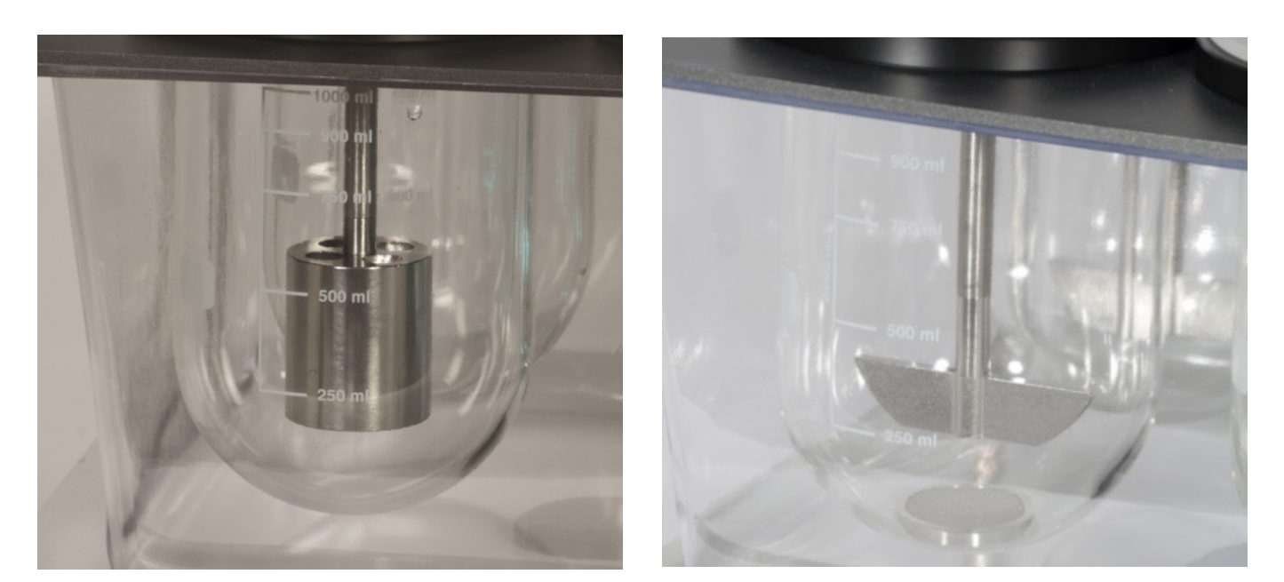
Figure 5: Methods for performance testing for TDPs use modified OSD dissolution testing apparatus and include: Rotating Cylinder (left) and Paddle over Disk (right).

Suppositories contain an active drug substance formulated in a solid matrix. Hydrophilic products are formulated with a water-soluble base such as polyethylene glycol and, once