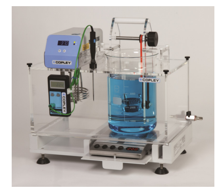
Figure 6: Disintegration testing apparatus for hydrophilic suppositories can also be used to measure the softening times of lipophilic products.

The suppository is a more common and accepted dosage form in Europe than in the USA, which may explain why Pharmacopoeial references to specific test methods for suppositories, are mainly confined to the Ph. Eur. The rate of dissolution of hydrophilic suppositories can be measured using the standard Paddle, Basket or Flow Through methods described in USP Chapter <711> and Ph.Eur. Chapter 2.9.3. The European Pharmacopoeia 8th Edition also includes a disintegration method for these products in Chapter 2.9.2. To quantify disintegration a sample is inserted into a cylindrical sample holder that is immersed in a glass vessel contained within a water bath controlled at 37°C. Every 10 minutes, during testing, the sample is inverted through 180 degrees to promote disintegration which should occur within a predetermined time.