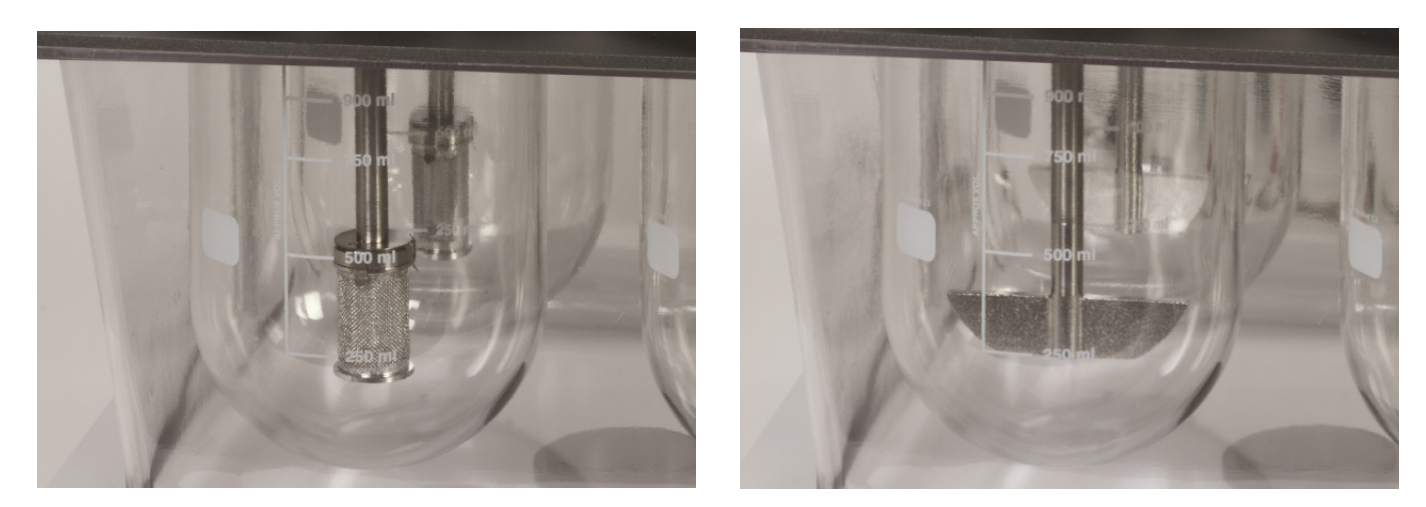
Figure 3: The most common types of dissolution testing apparatus are Apparatus 1 (Basket) and Apparatus 2 (Paddle)

The most common apparatuses used for dissolution testing are Basket (Apparatus 1) and Paddle (Apparatus 2). A dissolution tester consists of a cylindrical vessel that holds the simulated gastric juice dissolution media, and is partially immersed in a water bath to maintain the dissolution apparatus at 37°C. In the Basket method, the tablet or capsule is contained in a cylindrical mesh basket, whereas in the Paddle method, it simply sinks to the bottom of the vessel below a paddle (see figure). During testing, the basket or paddle is rotated at a specified speed, and samples of the dissolution media are extracted at predefined time intervals to determine the percentage of dissolved drug present, typically via HPLC. These results enable the generation of a dissolution profile, a plot of drug release as a function of time. Other techniques specified in the USP for dissolution testing include: Reciprocating Cylinder (Apparatus 3), Flow-Through Cell (Apparatus 4) and Reciprocating Holder (Apparatus 7). These are not routinely required except for highly specialised dosage forms.