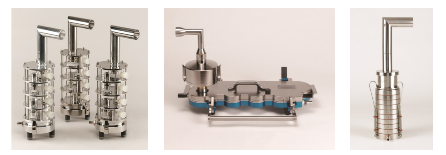
Figure 8: The MSLI, NGI and ACI are all referenced in compendial methods for determining the APSD of OIPs but the NGI and ACI are the instruments of choice for the majority of testing.

impactors - common to both Ph.Eur. Chapter 2.9.18 and USP Chapter <601> - are: the Andersen Cascade Impactor (ACI); Next Generation Impactor (NGI); and Multi-Stage Liquid Impinger (MSLI). In the case of Ph.Eur. Chapter 2.9.44 and USP Chapter <1601> for nebulisers, only the NGI features due to its lower range of calibration flow rates.